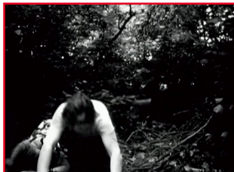
Fig. 8: The Grandmother

The fertilization itself is represented as an abstract explanation of life echoing the drawings of medical or botanical books. This abstract representation anticipates the bodiless viewer because it represents the anatomy as seen by a surgeon under a microscope. In other words: