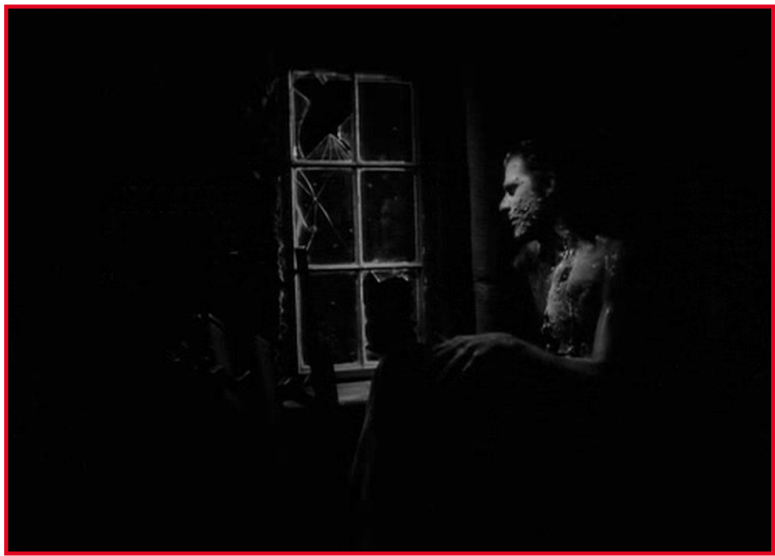
Fig. 2: Eraserhead

of the necessity of it,... [second panel:] is far from being so obvious as it may appear.” Then we see the last two panels without any representation of sound but with the clear hint of the progression of time: The final panel shows the same garden at night. In the first three panels, the representation of space is uniform, whereas the panels differ in the representation of time. The last two panels differentiate by time and space, but without any representation of sound. The representation of sound by the balloons in the first two panels thus suggests for the reader a procession of time. The abstraction of space of the final panel – in which only a small part of the garden is illuminated by the light of the house – suggests the idea of a wider space no longer limited by the fence or factory. The abstraction of the representation produces a paradoxical sense of an endless space within the frame of a picture, like we shall see more explicitly, some shots of Eraserhead . [Fig.2]