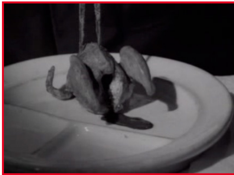
Fig. 3: Eraserhead