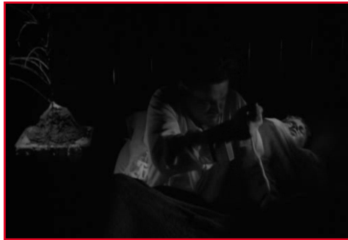
Fig. 10: ERASERHEAD

Even the scene of real sex Henry performs with his beautiful neighbor is unreal. There clear implication that this scene is a dream and occurs only in his head. The scene ends in a theatre with another girl whose face appears to be infected. This scene is key for an exchange of destruction and vitalizing, machinery and life in both ways. When Henry is touching her, the screen turns white from the projection, indicating the contact of an electric stream and the eraser effect by light. The same light, which can produces pictures is therefore the means to obscure it, but it is also true to say that the same light which can produce the imaginary of the cinema