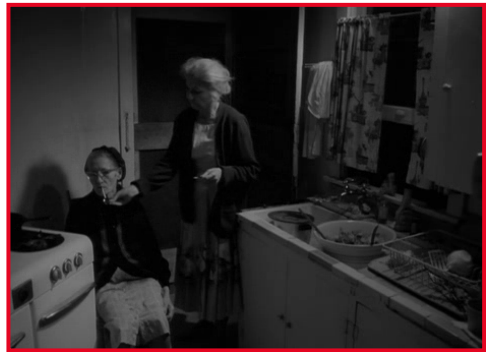
Fig. 4: Eraserhead

Each strip repeated the same introductory blocktext implying the reader’s task to see dead or living pictures: “The dog who is so angry he cannot move. He cannot eat. He cannot sleep. He can just barely growl... Bound so tightly with tension and anger, he approaches the state of rigor mortis.” The motive of the paradox of a living being that is more than dead also appears in many of Lynch’s underground films: the fried chicken in Eraserhead that starts to move and to produce bodily fluids on the plate when the protagonist Henry tries to cut the chicken [Fig. 3]; or the grandmother who cannot move and speak any longer but at least smoke [Fig. 4]. Even in his Hollywood film Blue Velvet there is the corrupt policeman at the end of the film who is almost dead and still standing upright at the same time [Fig. 5], while in Twin Peaks special agent Cooper is shut down and at the same time talking with the clerk of the hotel about a glass of milk. This trope is a key to the relation between stillness and motion. But furthermore it is not only the motive of the threshold-experience between life and dead. On the one hand, it is a metaphor for the threshold-experience of postmodern art