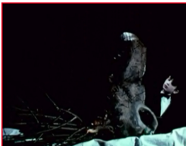
Fig. 9: The Grandmother

The abstract drawings of the body's inner world make forget the armed eye which is a condition to get the knowledge of the body's inner geography. Moreover, in the abstract representation of birth there is no clear distinction between plant, animal or even mechanical, beyond or within the body or apparatus, and life itself. The lack of indexicality enables the animation to have choice of references between signs and signification. Life, instruments, cyborgs, plants and animals establish a network amongst one other like a rhizome. But with the birth and the transformation into the indexical film, the rhizome ends as animal life emerges a clear hierarchy. The dogfather attacks his own child to maintain the hierarchy.