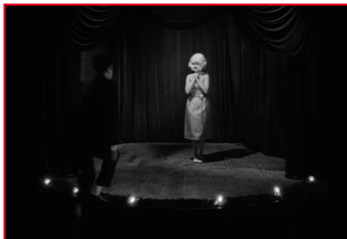
Fig. 12: Lorem Ipsum

The filmed theatre appeared first as Henry lies on his bed, gazing at the radiator [Fig. 11]. It is obvious that this scene is a symbolic representation of cinema, because behind the radiator appears an electrical lightening background, as if there was an apparatus starting a projection [Fig. 12]. It seems that the two cinema's bodies in this projection are not neglected. After the sex scene with his neighbor, Henry appears in the filmed theatre behind the radiator as actor and audience at the same time. The filmed theatre – another motif of Lynch's films – presents that which cannot appear in cinema without destroying the conscious perception: Henry pays the revelation of the undecided schizogaze of the cinema with the death of his subjectivity by losing his head – but not as in a horror movie, marking the end of his existence. In place of his head he becomes a phallus so that he retains his sexual productivity as vegetative existence beyond a cogito. This scene of theatre in the film allows us an insight into the closeness of destruction and production on a new level: The schizogaze of cinema can always remain undecided between a democratic opening and a paranoid