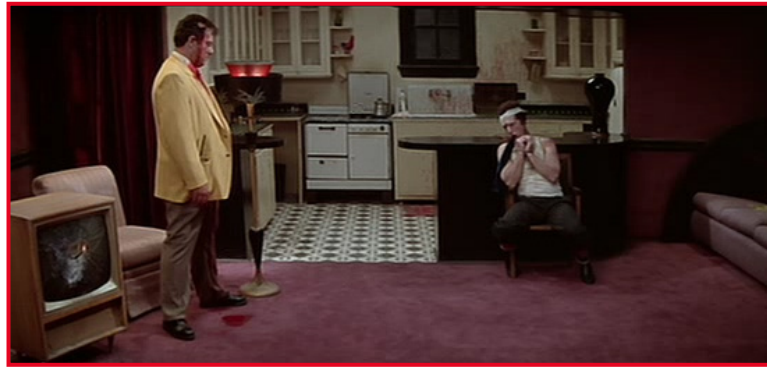
Fig. 5: Blue Velvet

production under the condition of a new intermediality where the distinction between author and reader remains unclear. On the other, it is a metaphor for the capitalistic structure triggering permanent thresholds between destruction and production of new social spaces by new media of communication, as we shall see.