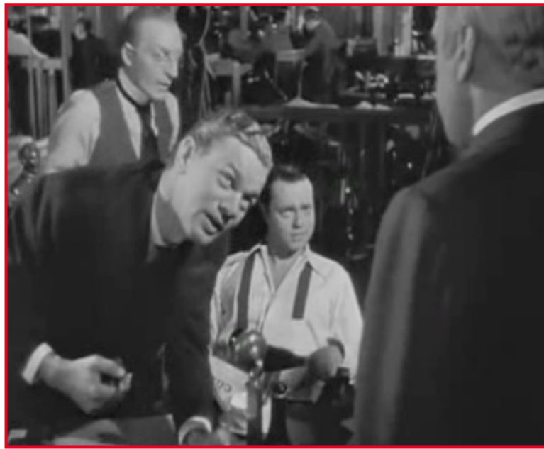
Fig. 5: Citizen Kane

for realistic cinema, and thus does not appear to reference Lynch's film language. But in his discourse on Murnau's silent film Tabou , 11 Bazin argued that the sequence shot of a ship without a tracking camera would be a substitute for the sound of a film. There is just Bazin's explanation of his favor for realism. But one could suppose that the sequence shot without tracking camera strengthens the observer's feeling for his real body-position in space. Therefore it triggers the subjectless and unconscious everyday activity of our perception to construct a spatial context with the sonic surrounding. There is not only a diegetic realism of the body in the pictures of a film, but also a non-diegetic realism of the body in front of the screen, which allows us to understand the relation of Bazin's statement about Murnau and Welles.