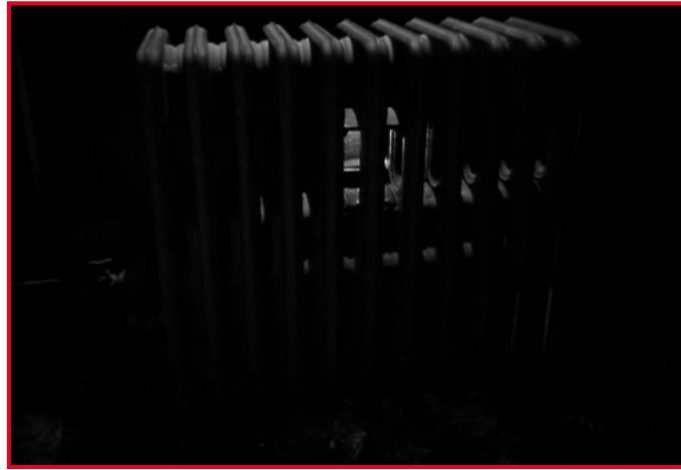
Fig. 11: Lorem Ipsum

is able to make the surface of the screen appear as an object to the viewers real (non-diegetic) space: a diegetic illusion and the disillusion at the same time as another expression of the oscillating schizogaze. The unconscious rhizome of chaining pictures is therefore no escape from this new capitalism. The film is acting as a witness against itself.