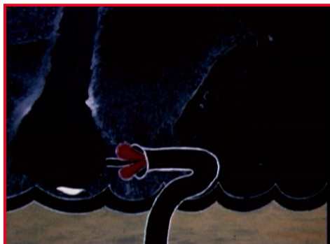
Fig. 7: The Grandmother

the transition from animation to moving pictures of a film's indexicality – appear as the mother earth give birth to the parents of the child. They emerge like plants, but become more and more animal like, transforming into barking dogs. [Fig. 8]